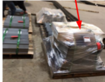
Example of equipment pallets

All other materials are on a pallet and shrink wrapped. Wood Materials and Boxes are packaged together on one pallet