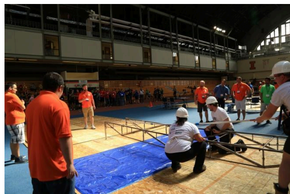
Judges at work during bridge construction