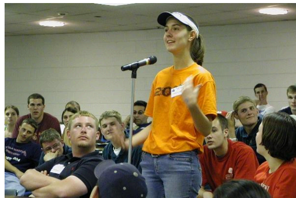
Student asks a question

Suitable venues may include classrooms and lecture halls with an audio/visual system and a white/black board or flip chart. There should be enough seating for team captains, other team representatives, and any judges who wish to attend. The captains meeting typically lasts between one to two hours.