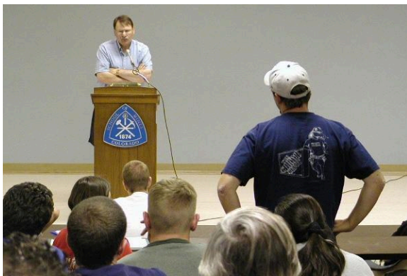
Head Judge listens to a question

All captains must attend this meeting, and they will be responsible for conveying any pertinent information to the rest of their teams. The head judge typically conducts this meeting, and the other judges may be invited to attend. Room size limitations may restrict the number of participants to only the team captains and judges.