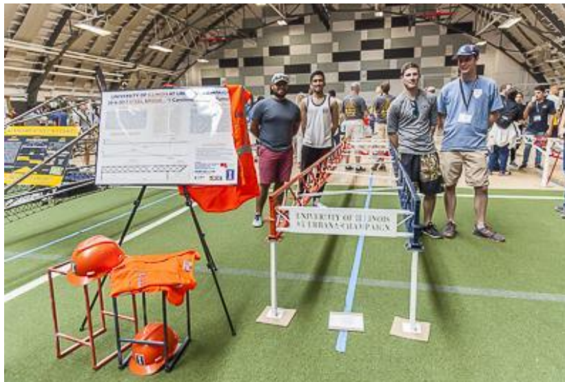
Bridge with school name clearly labeled and poster

You should coordinate with the head judge about who will judge aesthetics. The head judge will let you know if additional volunteer judges are needed.