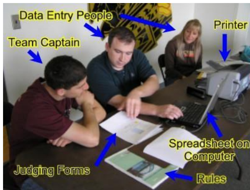
Data from score sheets is entered to the computer spreadsheet

A judge will be assigned to either oversee or actually do the data entry. It is often best for the team captain to read off the data as the computer operator inputs the values. Together, they should verify that all data is entered correctly. The marshal may help resolve any issues with interpreting judges' handwriting.