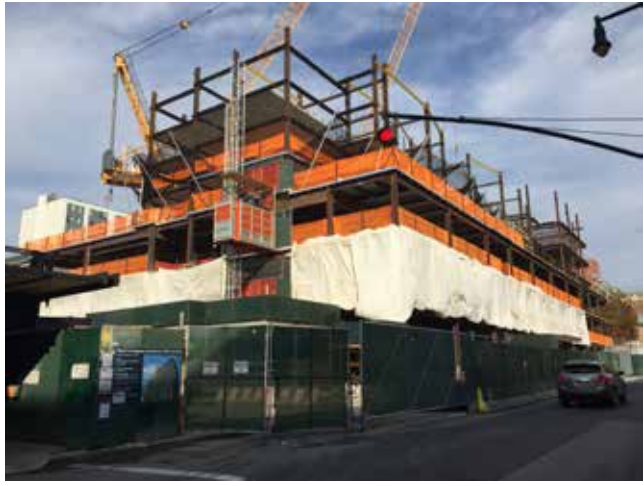
Construction of the residential building.