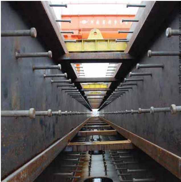
▲ Tie bar and stud layout.