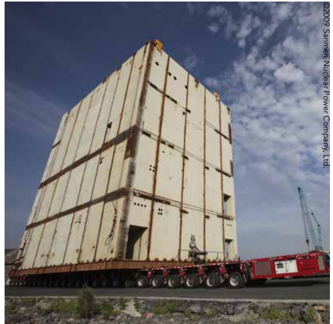
▲ An SC module being transported at a job site.

design guide is intended for use in conjunction with this spec. Now available at www.aisc.org/dg , it: