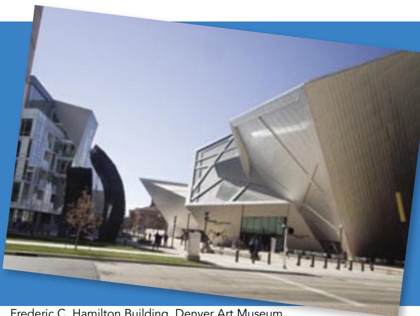
Frederic C. Hamilton Building, Denver Art Museum.