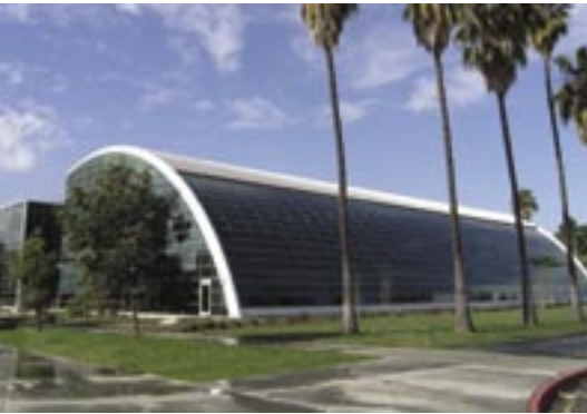
RAW International, Inc.

Architecture can be catalyst for change. This was the approach that RAW International took when designing the Library Learning Resources Center at El Camino College Compton Center in Compton, Calif. The college wanted a signature building image that would not only identify the library and its growing campus as high-tech center for learning, but also change its image from hopeless to hopeful in a historically underserved area of greater Los Angeles.