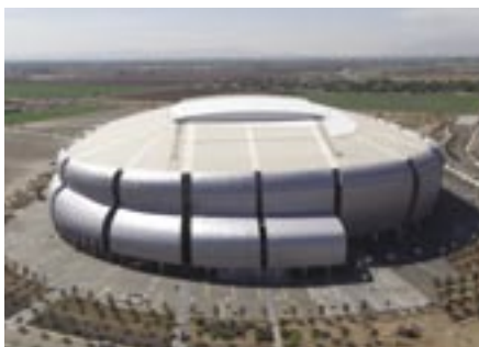
Visions in Photography