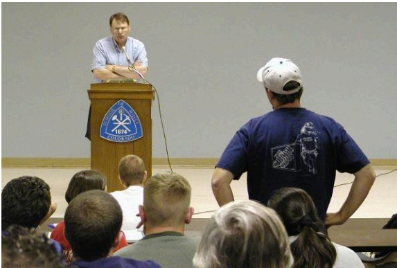
Head Judge listens to a question

All captains must attend this meeting, and they will be responsible for conveying any pertinent information to the rest of their teams. The head judge typically conducts this meeting, and the other judges may be invited to attend. Room size limitations may restrict the number of participants to only the team captains and judges.