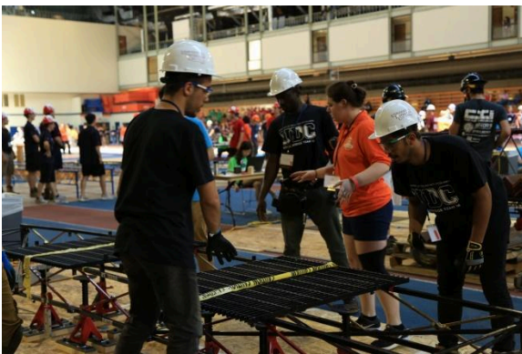
Judge giving instructions at load station

At the judges' meeting, questions regarding the Rules and procedures will be discussed, and the duties of each judge will be assigned.