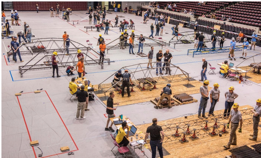
Indoor athletic facility with plywood protection at the loading stations

Some indoor facilities, such as athletic facilities with sensitive floors, may require installation of a protective layer of plywood. Covering the entire floor is likely not necessary. Some facilities may only require plywood at the vertical loading stations, while others may request plywood at each station. This should be coordinated directly with the venue.