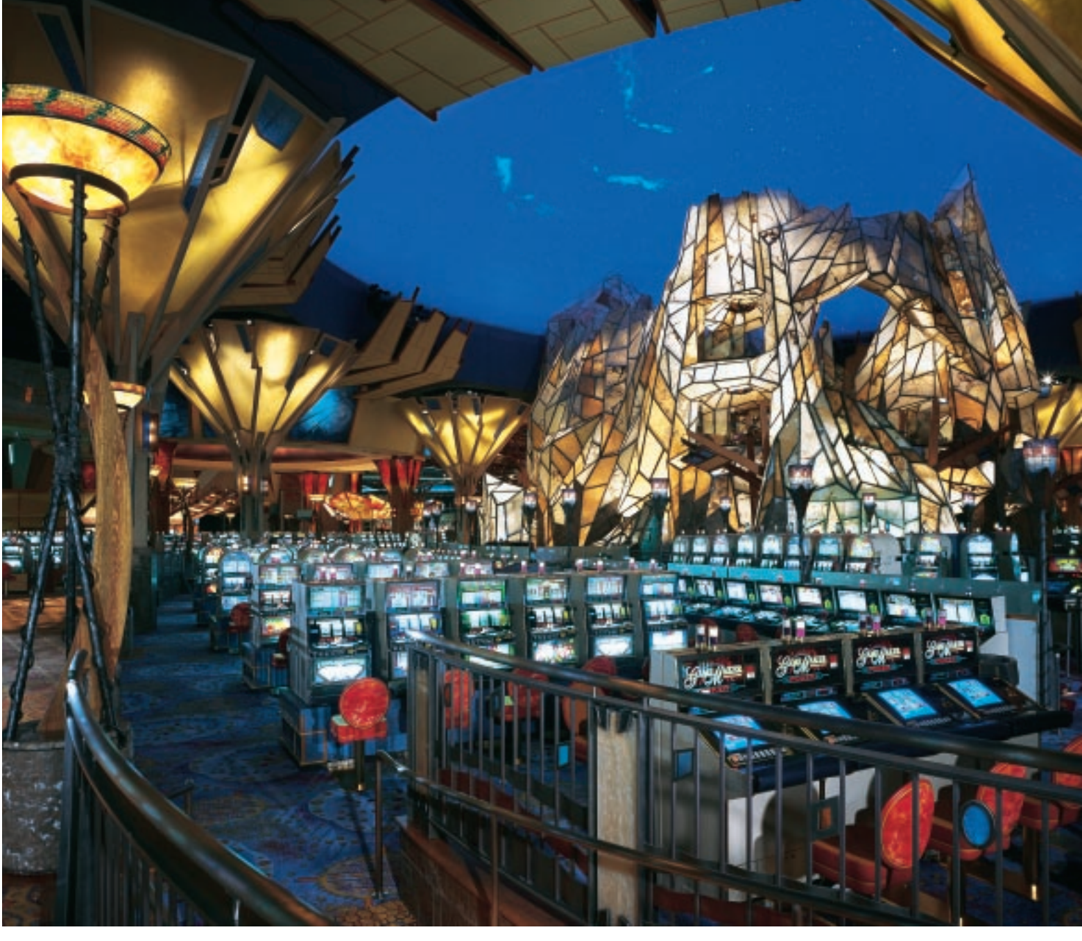
A major interior theme element, the Wombi Rock is a 60' tall interior mountain clad with translucent and opaque stone panels. A primary steel frame is attached to the building structure, and adjustable brackets are used to attach the panels.

ing members. The speed of erection more than compensated for any additional steel weight.