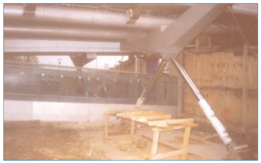
Four vertical dampers (two are shown in this photo) connect the bridge to the ground. They are 2.3 m (7.5') long, with a stroke of 275 mm (10.8'').

Testing consisted of three well-regulated crossings on the bridge by the