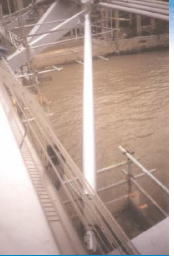
There are 16 pier dampers with a stroke of 60 mm (2.4").

this size and is within the present state of the art. However, it is generally accepted that control of only one or two vibratory modes is possible at large scale with current technology, far short of the number of modes being excited. In addition, the required actuator response frequencies and forces at any point on the bridge must be able to vary with both the localized and macroscopic crowd sizes. Thus, a robust control solution was required, even if only one or two modes were to be suppressed by active methods. A further issue was raised with respect to the amount of control power required, and the need for a continuous guaranteed power supply. These issues could not be resolved, and the concept of active control was discarded.