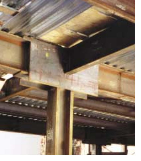
View of a typical SidePlate connection.

time frame, complete design and cost estimates could not be performed.