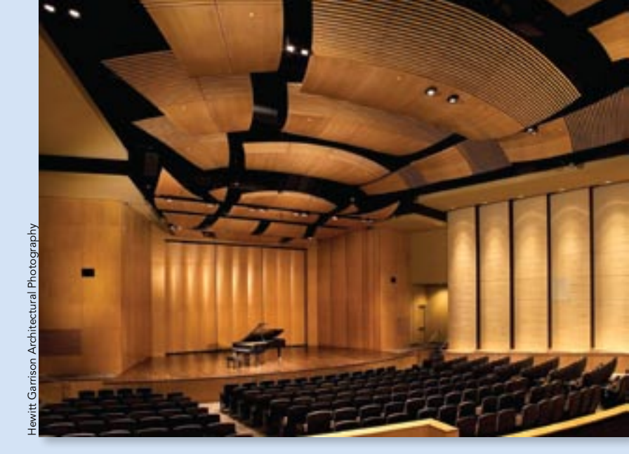
Interior view of completed lecture hall/ theater.