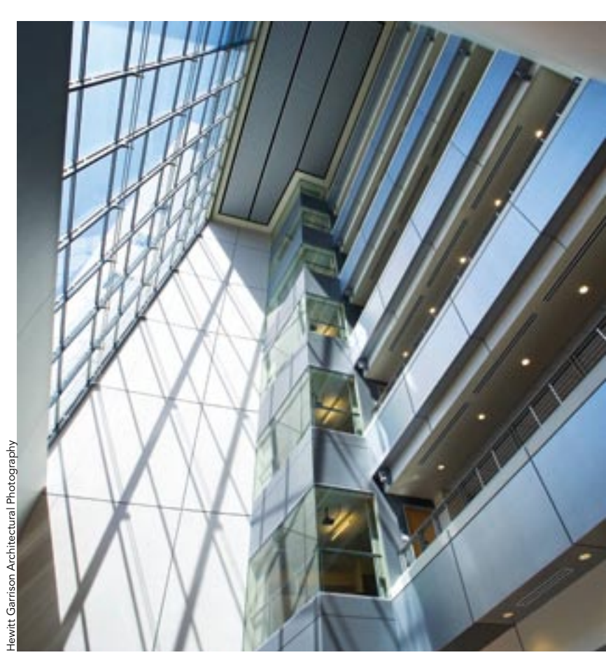
APRIL 2008 MODERN STEEL CONSTRUCTION

Interior view of completed atrium with steel cable-supported glazing system.