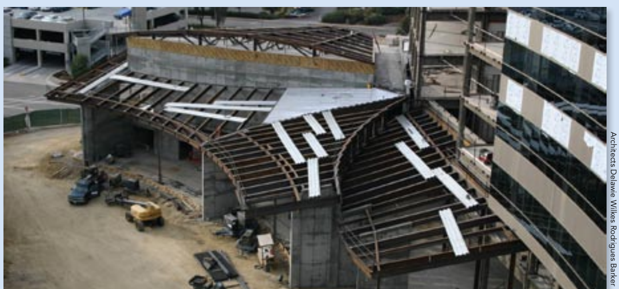
Overall construction view of lobby and lecture hall steel roof framing.