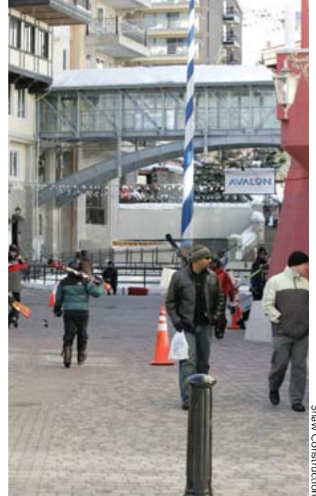
The completed pedestrian bridge, ready for skiers.

Monroe and Newell used RAM Steel to model the entire steel building frame. The model was divided to reduce the size of each part and to allow multiple users access to the steel model at the same time. While the steel detailing for the project was performed by Acuña Y Asociados S.A.--in Santiago Chile-the long-distance communication was handled by e-mail and a quick RFI turnaround process, along with the drawings being digitally transferred and locally plotted (several visits to Chile by Monroe and Newell also helped the process). The steel for the project consisted of more than 3,500 tons and 12,000 pieces. The hotel opened in time for Christmas 2007. MSC