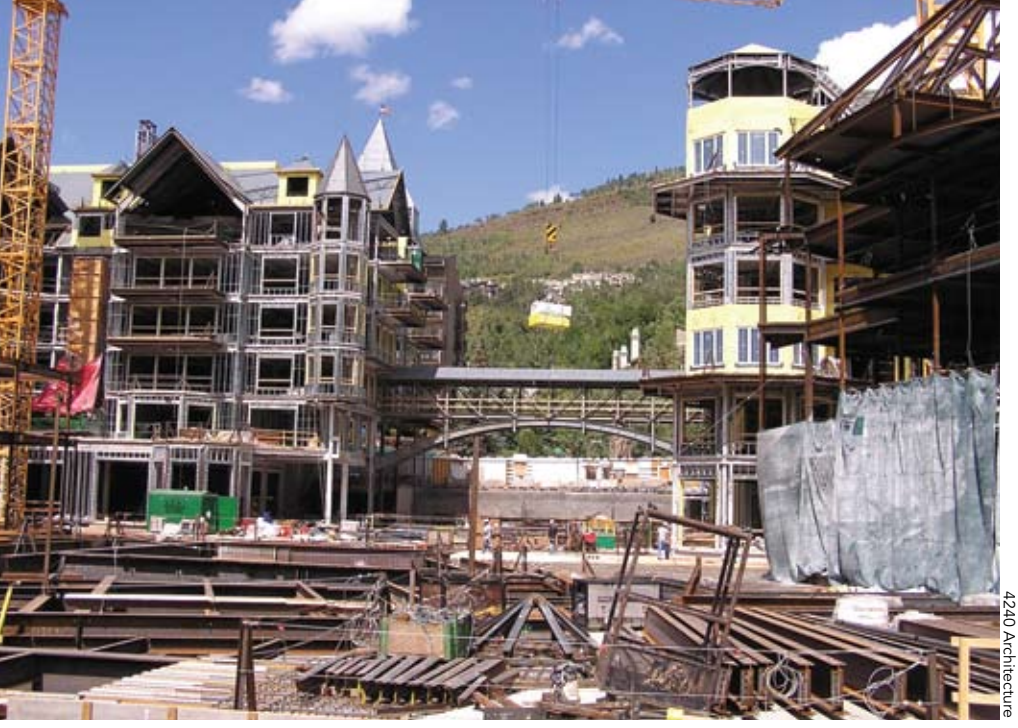
An 85-ft pedestrian bridge connects the east and west areas of the Arrabelle development. The entire project had more than 500 steel beam penetrations.

large-clear span ballroom required a double steel transfer beam with plating to keep the depths acceptable.