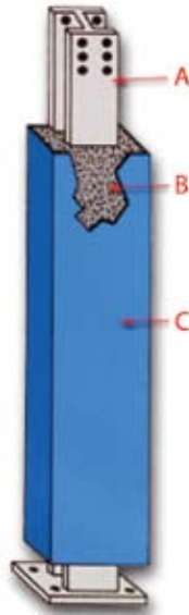
Figure 3: Fire-Trol column elements.