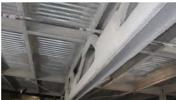
Figure 1: Steel framing with SFRM in place at Children’s Memorial Hospital under construction in Chicago. Inset shows the hospital’s signature handprint rendered in SFRM.