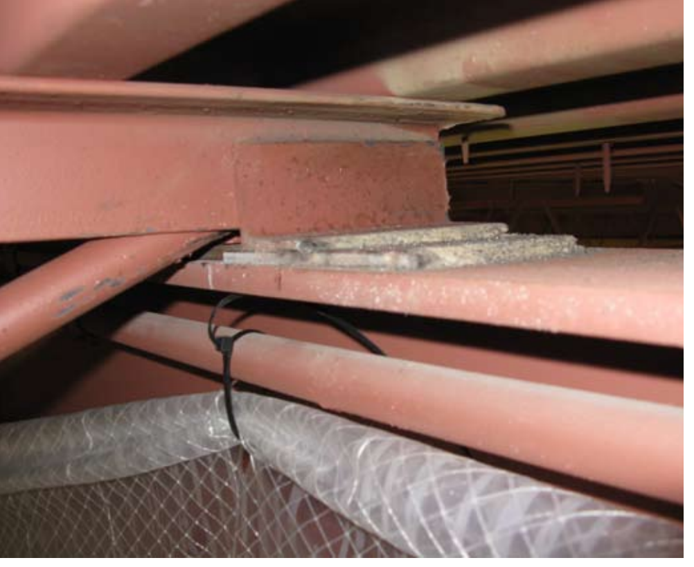
The 2¼-in. joist seat depth required a ¼-in.-thick shim be welded into place after the joist was erected.

Another benefit of field-bolted joists is that the joist seats can be manufactured with a 2¼-in. height versus the standard 2½-in. height. The reduced seat height provides easier insertion of the joists between the bearing surface and the metal deck. Similarly, the ¼-in. tolerance accommodates some angular movement as the joists are installed. After installation, ¼-in.-thick steel plates are installed beneath the joist seats to provide a tight connection against the metal deck.