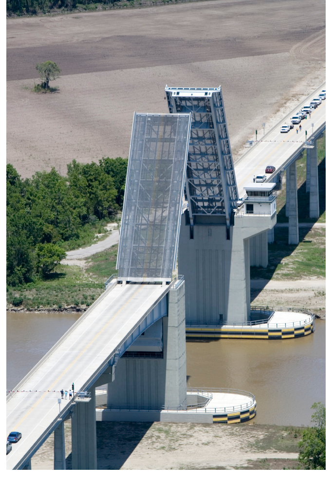
FEBRUARY 2011 MODERN STEEL CONSTRUCTION