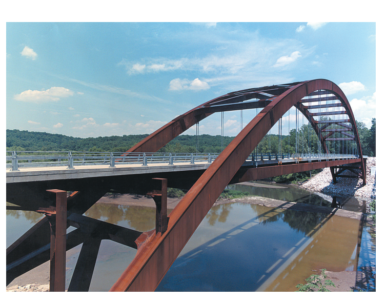
2001 Prize Bridge Award—Long Span: The Paper Mill Road Bridge in Baltimore County, Md., features a steel box arch.