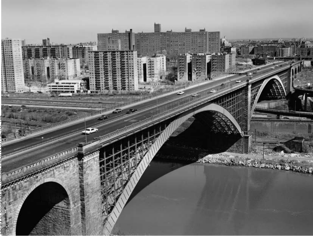
▲ The north side of the Washington Bridge with Manhattan in the background circa 1970.

elapsed, and the commission planned to modify them during construction. Work on the substructure commenced immediately.