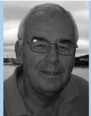
Jim Talbot is a freelance technical writer living in Ambler, Pa.

The Board of Commissioners of Central Park conducted studies about the possibility of building a bridge across the Harlem River as early as 1868. In 1870 the city purchased land for this purpose at a site about 2,000 ft north of High Bridge, which is part of the Croton aqueduct across the river.