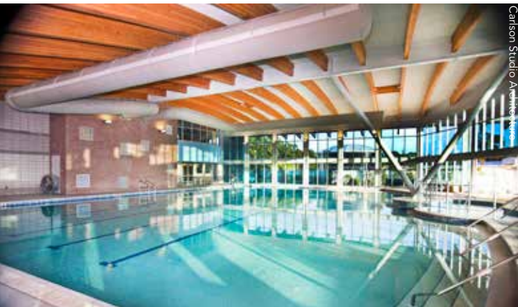
▲ A V-shaped pair of 10-in.-diameter HSS columns support a 94-ft-long girder, springing from the center of the pool from a common base plate.