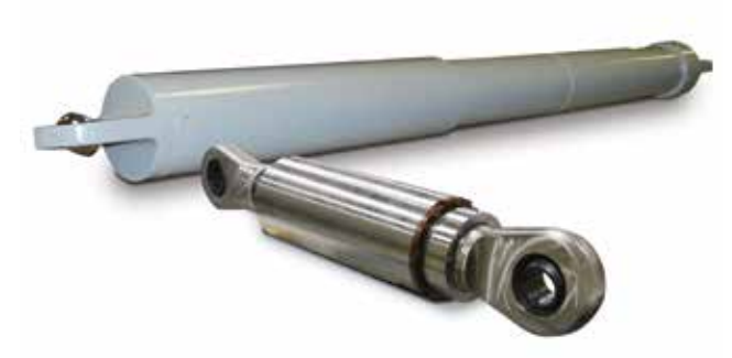
ITT Enidine's TYPE-B and TYPE-H fluid viscous dampers are designed for a long life span, with customized features that provide the expected design performance during a seismic event.

Whatever the application, a high level of design, technology, engineering support and testing, along with the associated higher quality levels of the products, are essential to seismic protection and sustained performance and are key attributes to FVD technology.