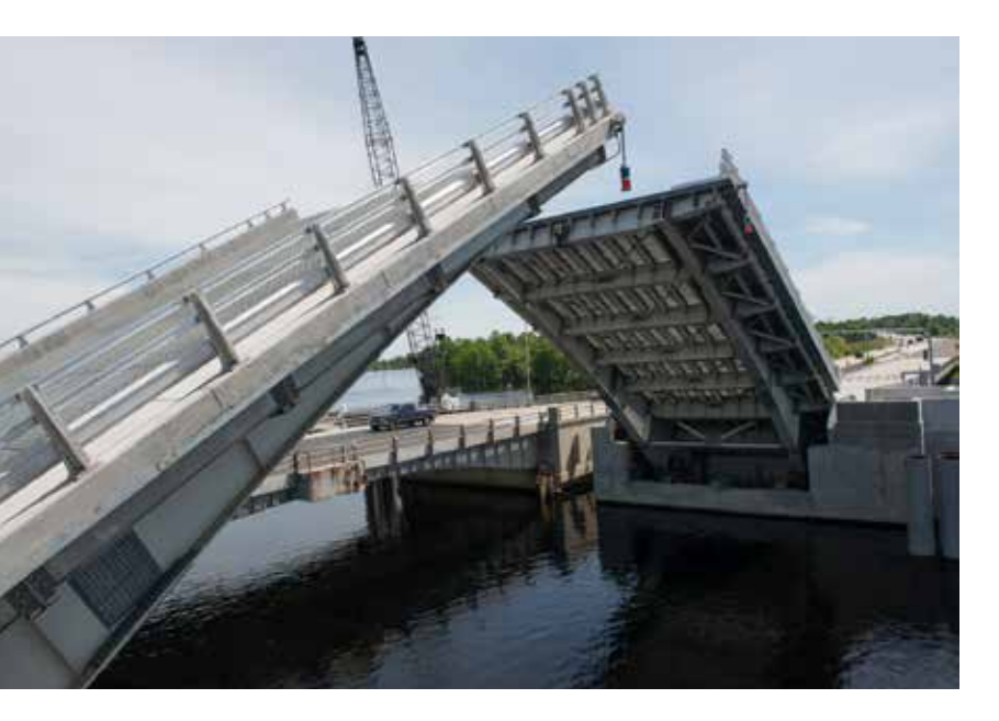
Each counterweight contains around 66 tons of steel ballast and 90 cubic yards of concrete.