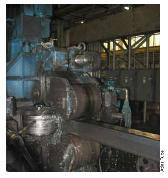
▲One of the last steps in producing HSS involves straightening of the walls in a Turk's head, shown here.

Even beyond the opportunities provided by these large A500 shapes, rounds, squares and rectangles outside the